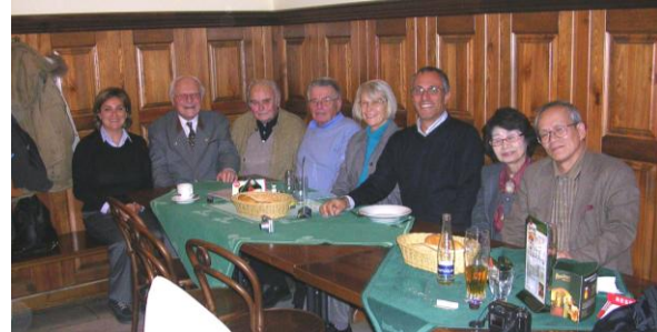
A relax in a typical old style restaurant