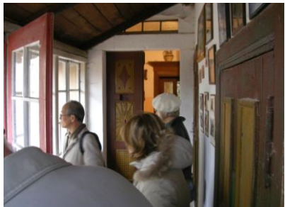
In the Dvorak family house