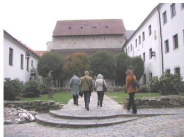
The old royal palace from the river (at left) and from the other side (nowadays serves as museum – its Director was our guide)