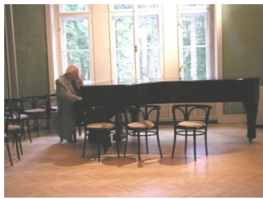
V.Nemec tasted the grand piano