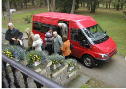
Arrival to the A.Dvorak Museum

VYSOKÁ: visit to the Memorial Museum of Antonin Dvorak and to the currently inaccessible Dvorak family private summer residence – the famous Czech composer wrote just here many chefs d’oeuvre (as explained by his last living grandson who took part in the whole excursion)