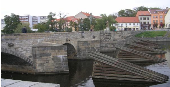
The eldest stone bridge in Bohemia

PISEK: both historical monuments of the old royal city as well as recent reconstruction after horrible floods of 2002 (the bridge with statues at that time completely under water)