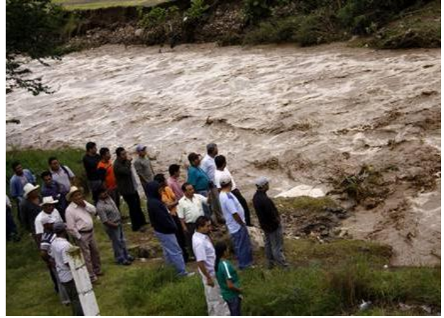
This raging river on Sept. 28 had cut off the bridge to the town of Santa Maria Tlahuitoltepec in Oaxaca, Mexico. Dozens of rescue vehicles were stuck at the crossing