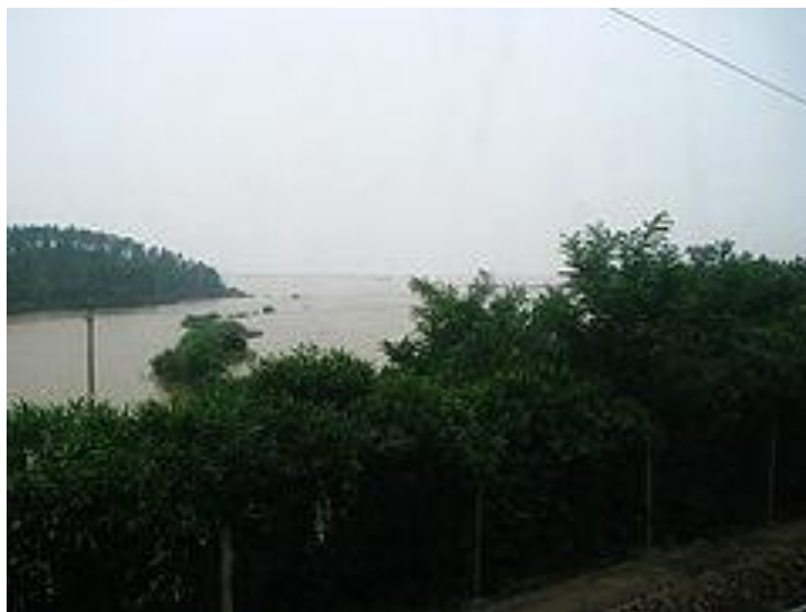
Flooding along the Gan River in Zhangshu , Jiangxi