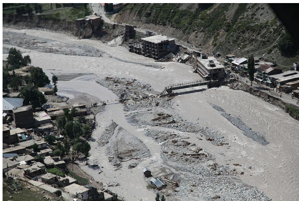
A bridge damaged by the flooding