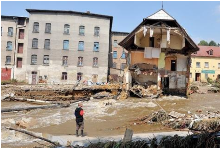
Flash floods tore through the town of Chrastava in the Liberec region Aug. 7-8, 2010, destroying homes and livelihoods