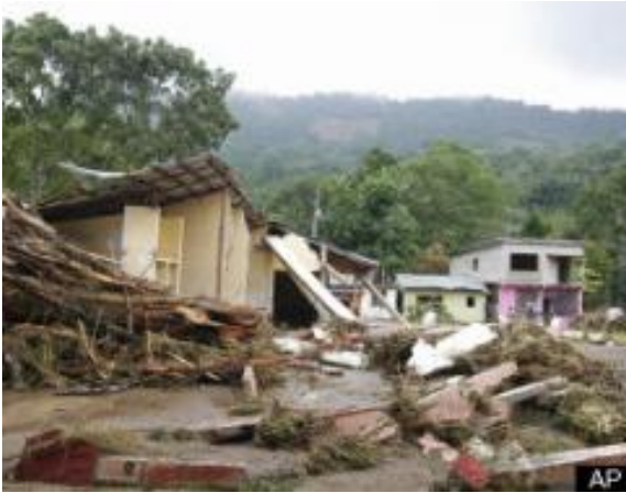
Debris from fallen trees and damaged homes lay on the ground in the town of Oxolotan in the gulf state of Tabasco, September 27, 2010